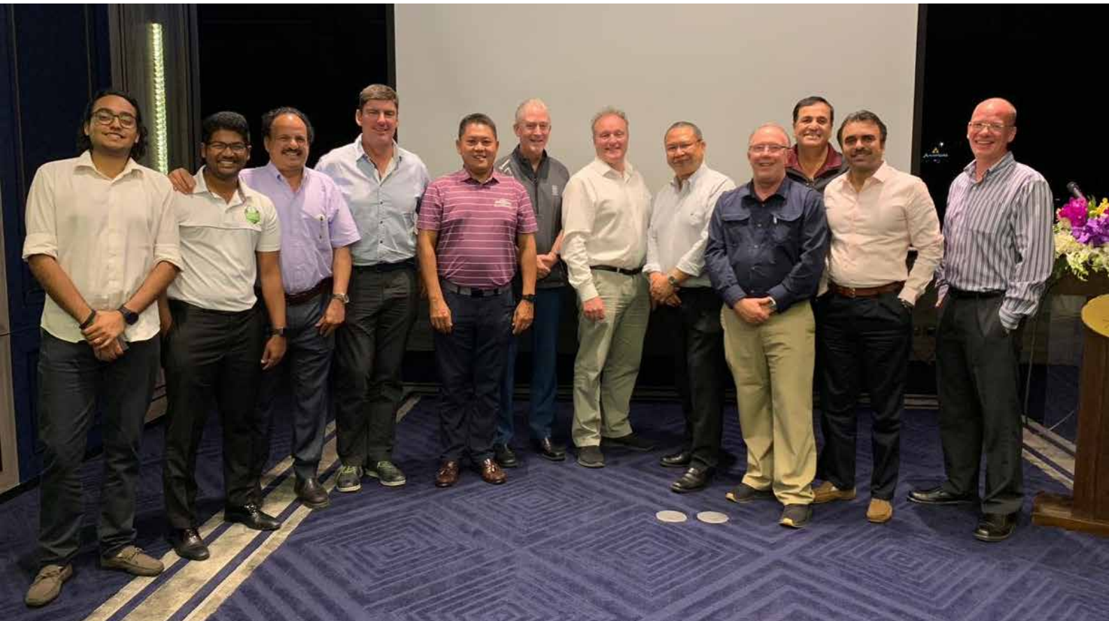
Above The Whole BMI Group

BMI Club Management / BMI Leadership Principles / BMI General Manager & Chief Operating Officer / BMI Tactical Leadership / BMI Strategic Leadership / BMI Golf Management / BMI Food & Beverage Management