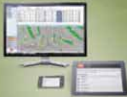
Lynx ® Central Control