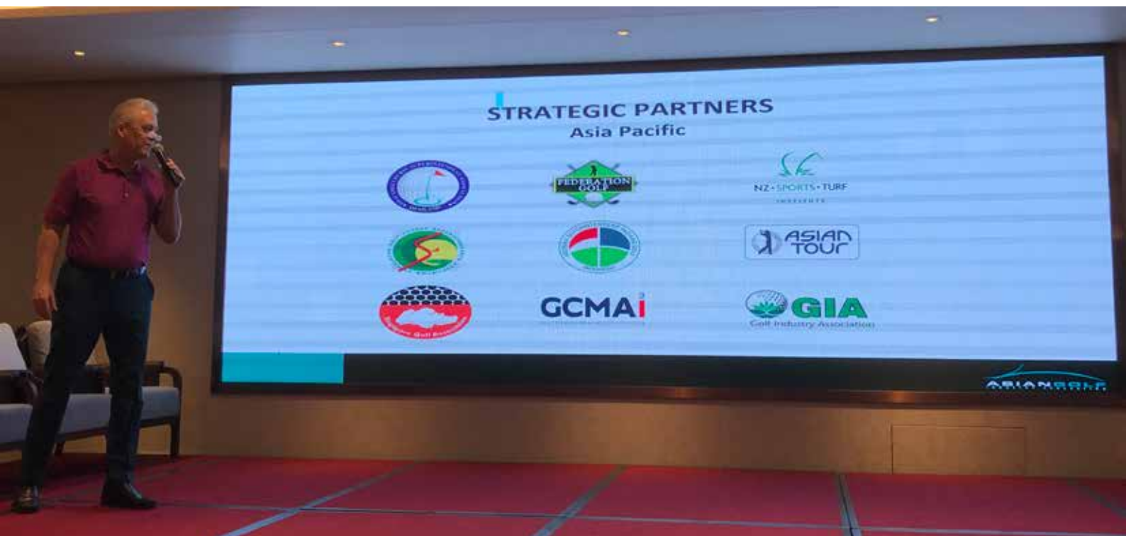
AGIF Presentation At Conference Showing GIA Logo