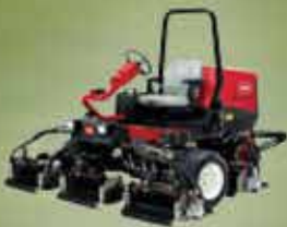
Reelmaster ® 3555-D & 3575-D