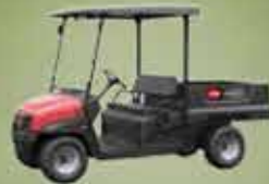
Workman ® GTX